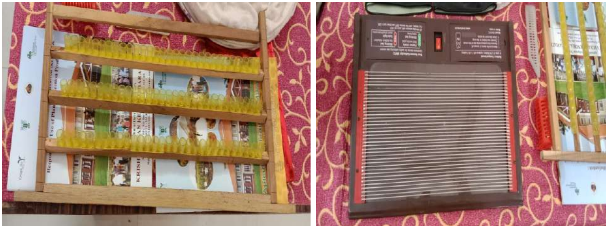
Artificial Queen rearing and Royal jelly collection cups Pollen traps used for pollen collection from honeybees

He also explained the beeswax extraction, bee venom extraction, royal jelly extraction and pollen extraction by showing the students the pollen trap used for extracting pollens loaded by honeybees and rearing cups used for artificial queen rearing process and collection of royal jelly.