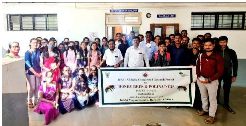
Feedback and Valedictory function of Workshop on Honey Bee handling and Practical's related to it