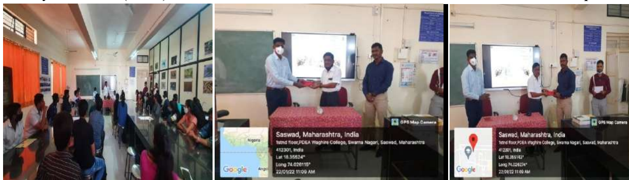
Inauguration of One day Workshop and Felicitation of Resource persons