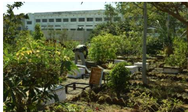
Hiving process of Bee colonies obtained from KVK, Baramati in New Departmental Bee boxes

After the hiving process, the resource people explained the difference between Ripe and Unripe honey and showed the process of Honey extraction from sealed honey comb frames. The assembled mob devoured the sweet honey after the honey extraction process. During all these process the use of the beekeeping equipments like Hive tool, Bee-veil, Overall, gloves, Bee boxes, smoker etc. procured by the Zoology department under the DBT STAR College Scheme was done.