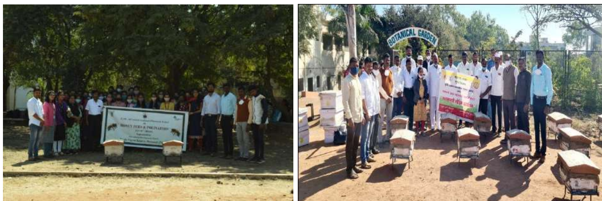
Hands on Training on Honey bee handling organised on 2 nd February, 2022 in Waghire College campus

Under the funding of the DBT-STAR College Scheme, the Zoology department of Waghire College, Saswad organized Hands on Training on Honey Bee handling for the Teaching and Non- teaching staff of Zoology department, S.Y.B. Sc Zoology students and nearby farmers on 2 nd February, 2022.