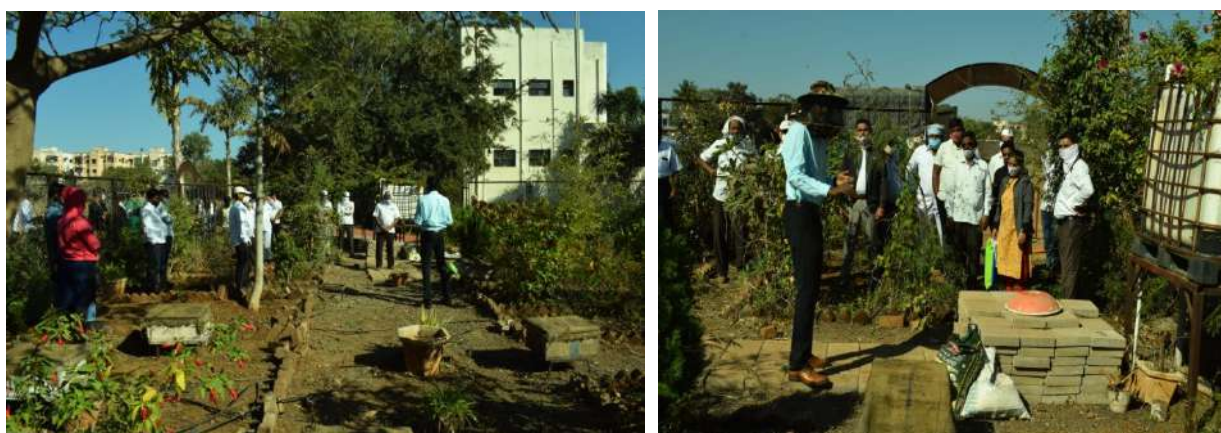
Hands on Training on Honey bee handling to the nearby farmers